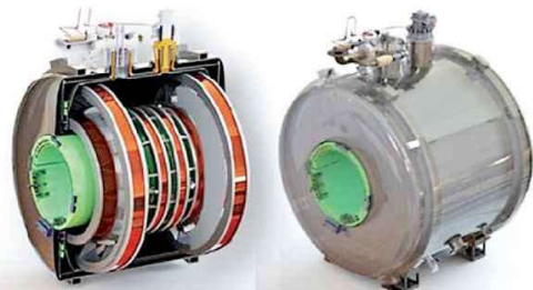
A cut-view of the MRI magnet coils, service turret and a cryocooler A view of the MRI magnet system after installing the magnet inside the cryostat