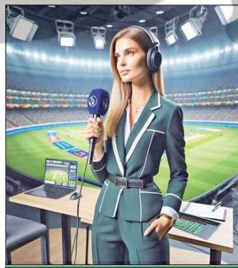
July 2 : World Sports Journalists Day

Sports journalism is like waltzing into a bustling stadium where every match spins its own mesmerising tale. It's not just about crunching numbers and statistics; it's about feeling the heartbeat of the game and deciphering its impact on society. Sports